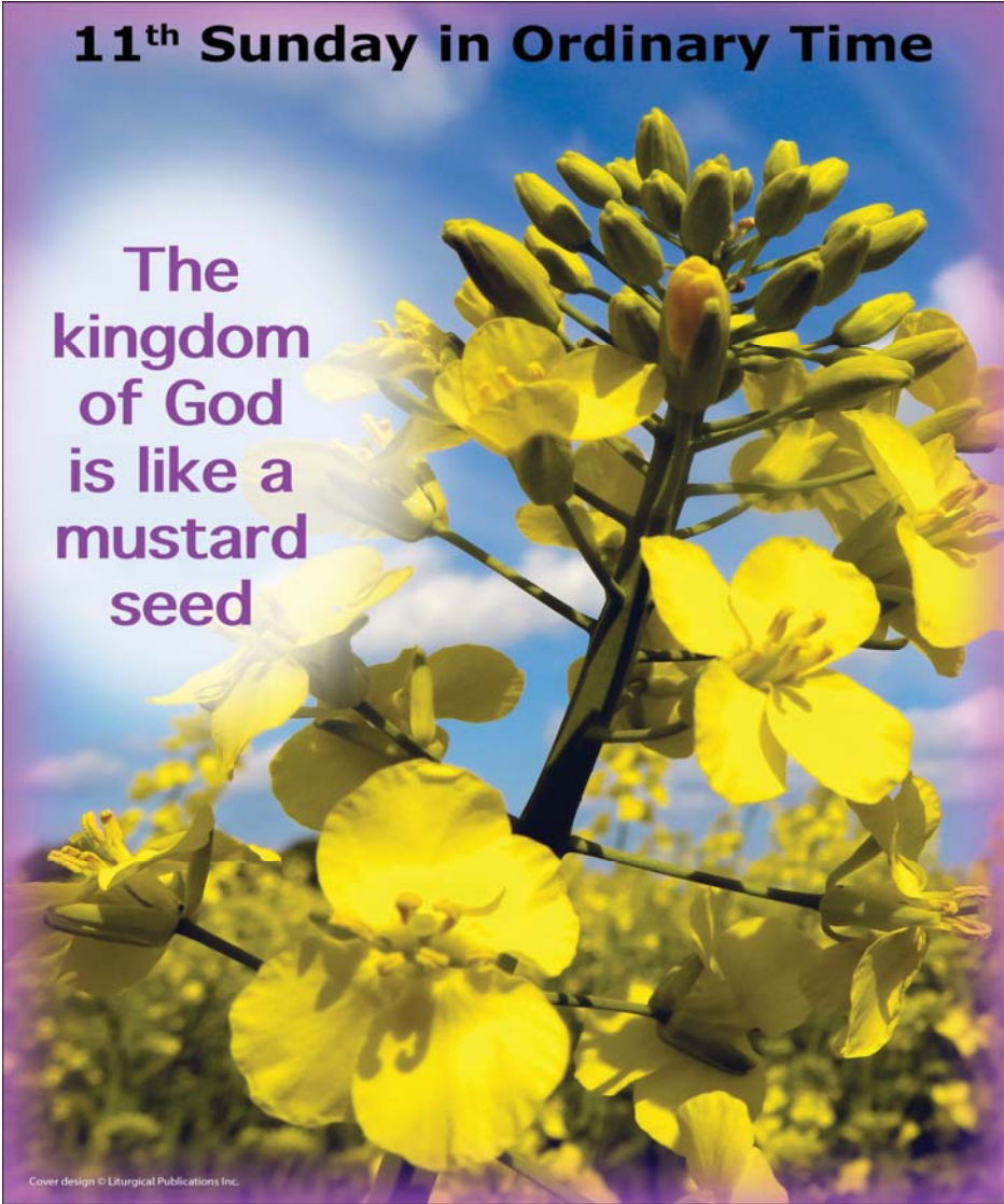
Cover design © Liturgical Publications Inc.

Mondays 9:30 a.m.-12:00 p.m. Wednesday 7:00-9:00 p.m. Thursday 7:00 p.m.-8:00 p.m. (Spanish)